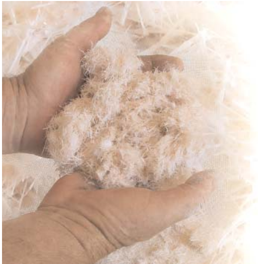
Recycled FRP fibers for viable and effective re-use.