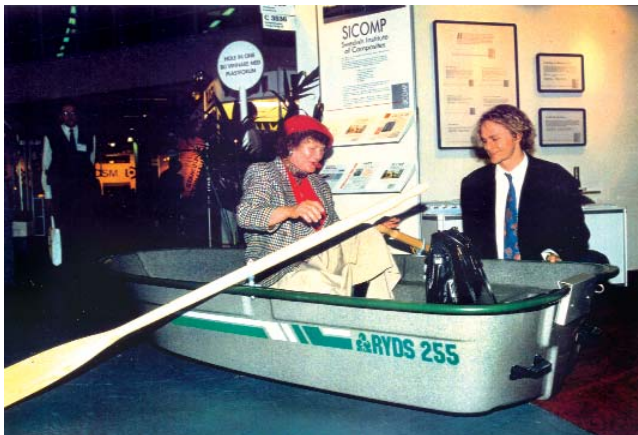
"Ecoboat" by OMC Rydsfabriken

In addition, our product has spawned the motivation for a new concept. Our material is now being used by OMC Rydsfabriken in Sweden to produce "ecoboats" from this type of polyester resin waste. Our work on recycling such materials has led us to the production of a new coating material with a surface similar to polished granite.